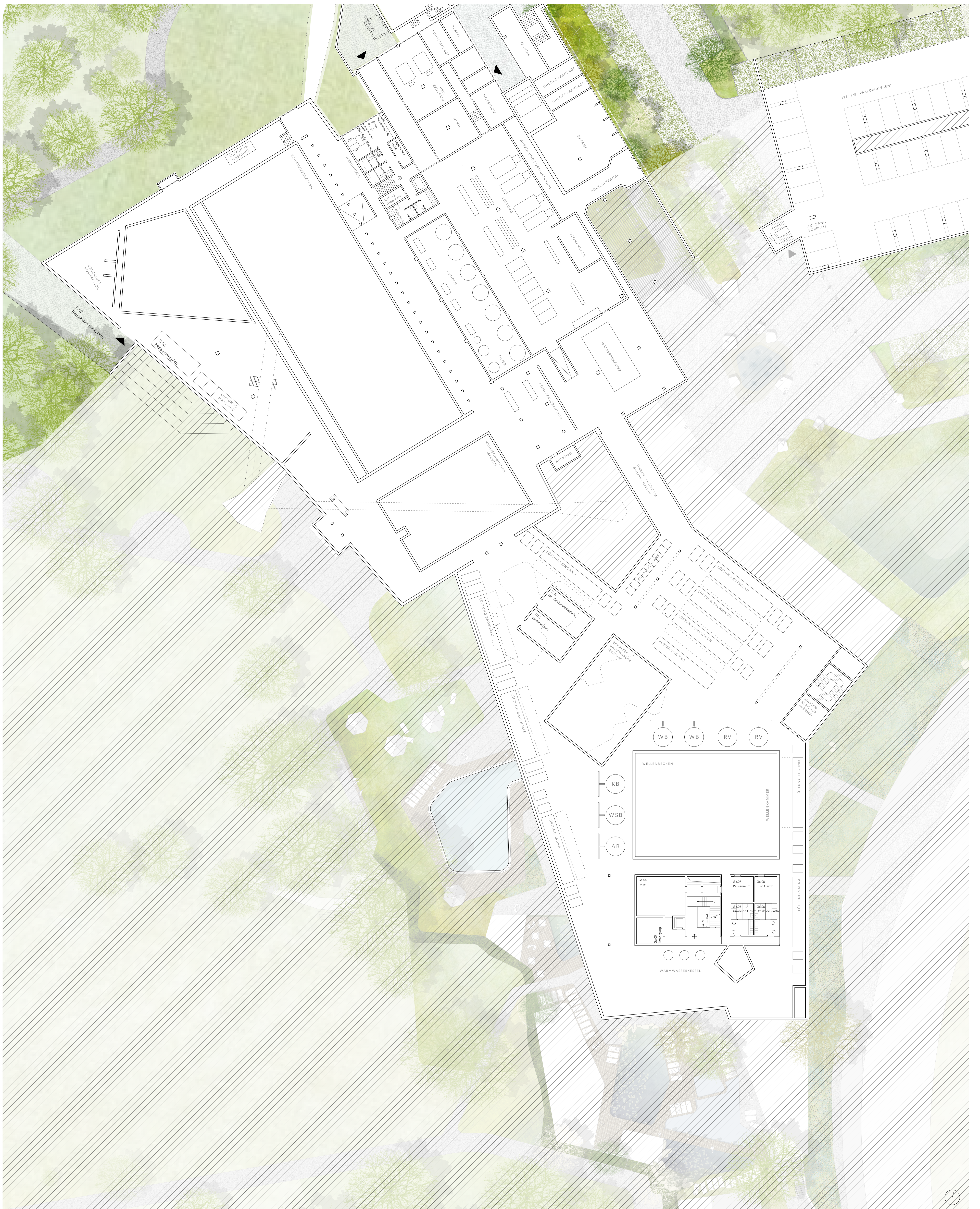
Grundriss Untergeschoss - M 1:200