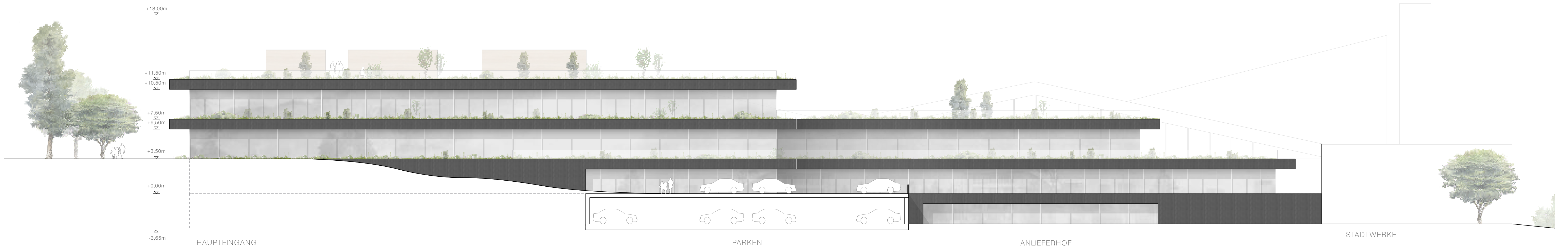
Ansicht Nord 1:200